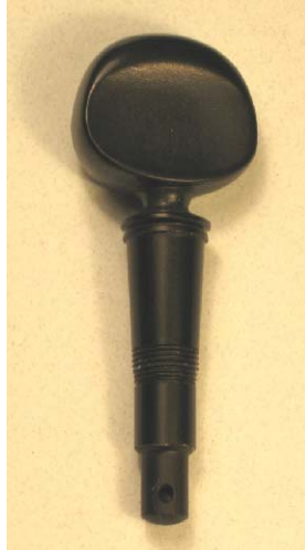
7mm \frac{4}{4} violin grip Weight: 28gms per set of 4 #744A--$20 each