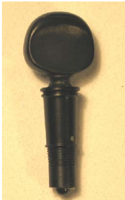
7mm 5th string "Short" \frac{3}{4} violin grip #743B--$24 each

Also available with full size ( \frac{4}{4} ) violin grip as #744C--$24 each