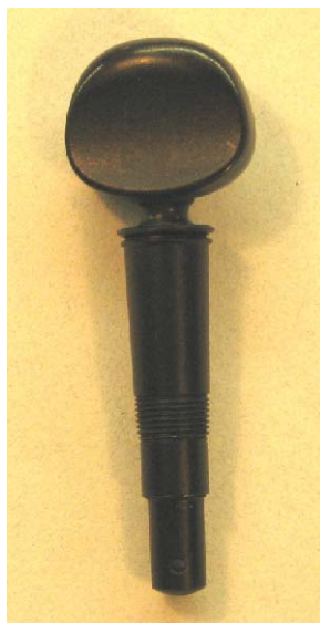
8mm with Violin size grip a larger diameter version of the #745A, with a smaller grip Weight: 55gms per set of 6 #844B--$25 each