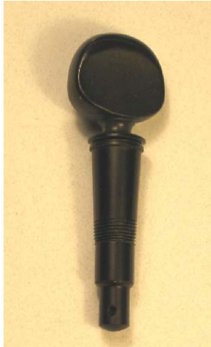
7mm \frac{3}{4} violin grip Weight: 24gms per set of 4 #743A--$16 each