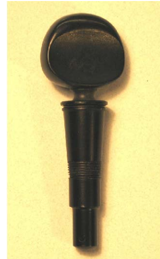
8mm \frac{4}{4} violin grip Weight: 35gms per set of 4 #844A--$20 each