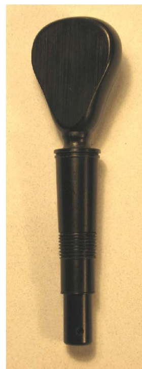
9mm “Classic” grip typical of 19th century and earlier instruments Weight: 91gms per set of 6 #945C--$20 each