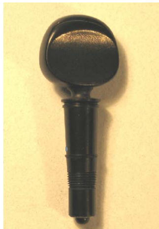
7mm 5th string "Long" \frac{4}{4} violin grip #744B--$20 each

Also available with full size ( \frac{4}{4} ) violin grip as #744C--$24 each