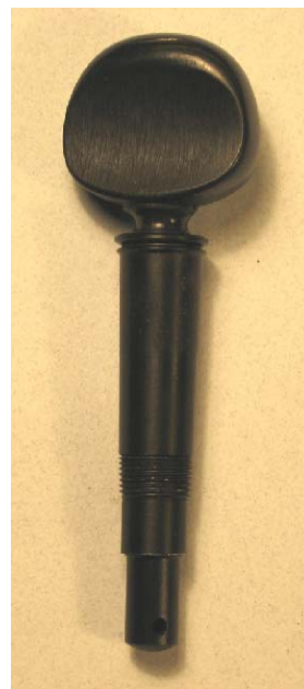
8mm with Viola size grip “Ramirez” size, typical of Spanish makers after WWII Weight: 67gms per set of 6 #845B--$25 each