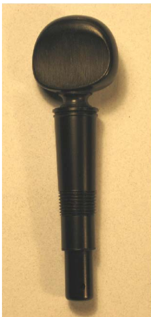
9mm with Viola size grip a larger diameter version of the #845A Weight: 81gms per set of 6 #945B--$20 each