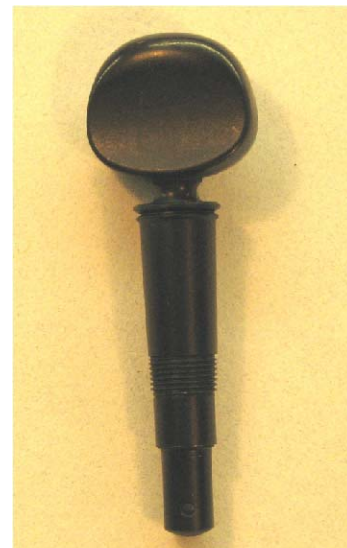
8mm \frac{4}{4} violin grip Weight: 36gms per set of 4 #844B--$25 each

Also available with \frac{3}{4} size violin grip as #743C--$20 each