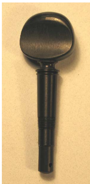
7mm with Viola size grip “Old Style” used by Spanish builders in the 1920’s and 1930’s. Weight: 53gms per set of 6 #745A--$20 each